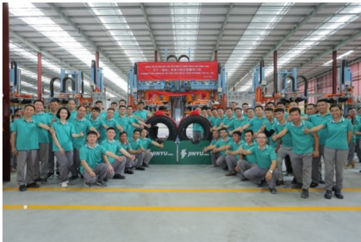
Jinyu (Vietnam) Tire produced its first truck tyres on 30 March, 2021

Jinyu's Vietnamese tyre plant has produced its first TBR tyre. The milestone for the new facility caps nine months of intense construction , as the project team of Jinyu (Vietnam) Tire Co, Ltd overcome multiple challenges including the Covid-19 pandemic. The facility includes 19 buildings over 130,000 square meters, containing 894 pieces of equipment. The production of the first tyre at 10:08 on 30 March 2021 marks the completion of the